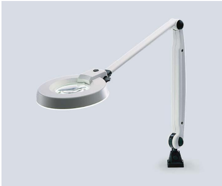
RLL 122 T