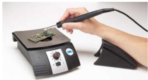
Rework small boards directly on the PCT-100

The PCT-100 will be available July 1, 2007. Please contact your local OK International Representative for more information.