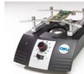
PCT-100 with Integrated Board Holder