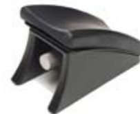
PCT-AR Arm Rest