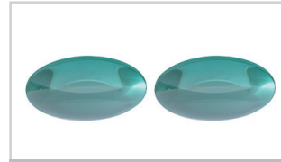
2 lenses included

lamp comes complete with: 22w Daylight™ tube, 2 lenses and table clamp