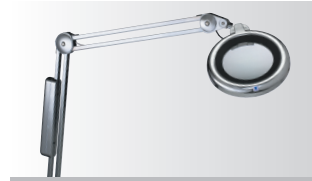
Stylish chrome version - D22034-01