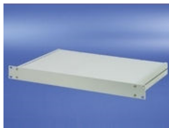
Photo shows 1 U