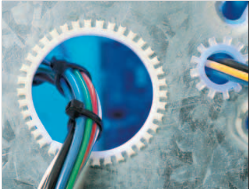
Optimal protection of cables and wires at panel edges.

Flexiform grommet strip is used to protect cables routed through sharp-edged cut-out sections.