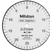
513-424E 513-414E 513-466E