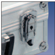
All cases are lockable