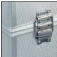
Sturdy hinges and edges